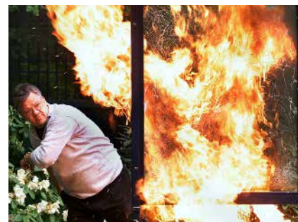
Execution of tests for security film PROFILON® ER1

The multiply film laminate with strength of 475µ is installed from the inside to the window pane and is solidly connected to the frame by a special frame fixture. In addition the highly specialized technology of PROFILON® ER1 provides an impact resistance, a protection against fire penetration and it is flame retardant.