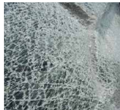
Destructions of glass in Oslo's centre after bomb explosion.